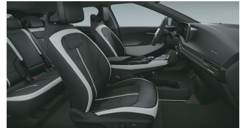
Saturn Black + Off white